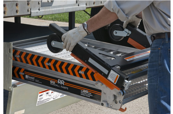
Open Leg Design