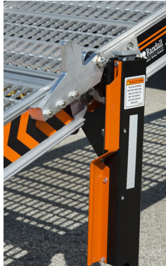
Optional Finger Guard