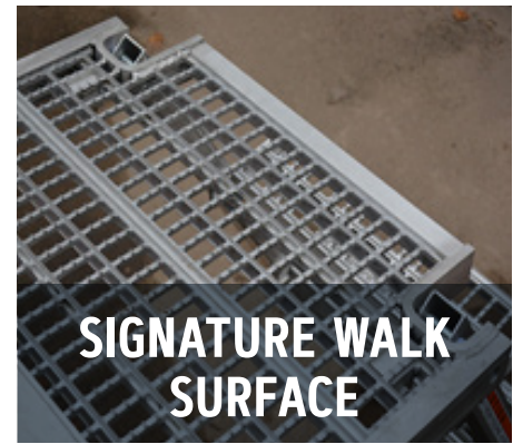
SIGNATURE WALK SURFACE

Spring lock ensures the FDP 3123L stays in place and disengages on your command.